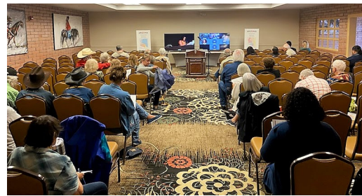
Sept. 23, 2021 attendees in Sierra Vista, Satellite location.