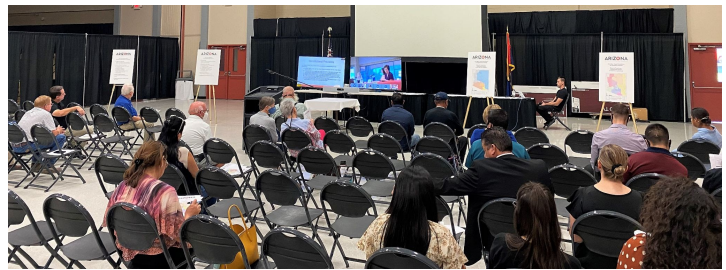
Audience at the Yuma Satellite location on Sept. 21, 2021.