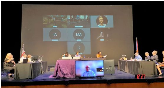
Commissioners, staff, ASL and Spanish interpreters, transcriptionist at the Scottsdale location Sept. 23, 2021