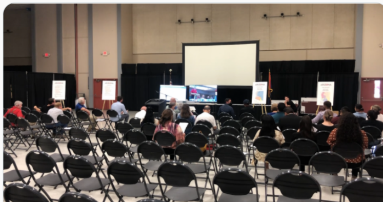
Community voices opinion on redistricting maps - KYMA The next election may look different depending on how new lines are drawn on the map. All this, following the latest census. Arizona's ... kyma.com