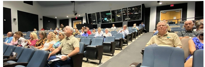
Scottsdale grid map attendees. Sept 29, 2021