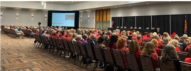
Tucson grid map meeting attendees. Sept 29, 2021