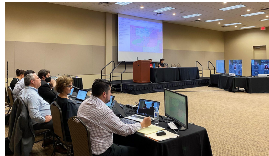
Mapping staff, attorneys and IRC at Desert Willow Conference Center Phoenix